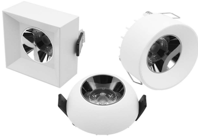
Dimension : Unit in mm