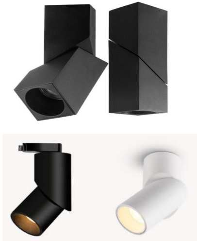
Dimension : Unit in mm